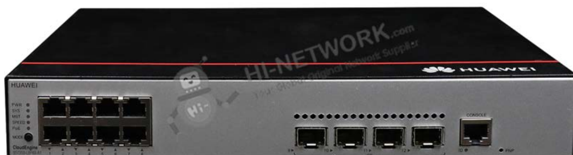
Figure 1 shows the appearance of S5735S-L8P4S-A1.