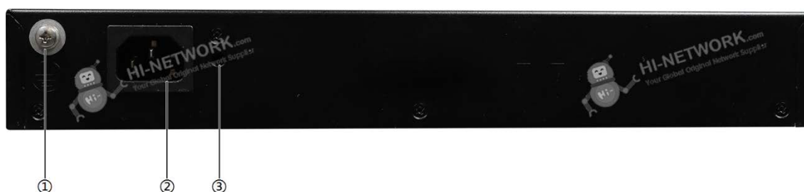
Figure 3 shows the back view of S5735S-L8P4S-A1.