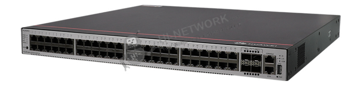
Figure 1 shows the appearance of S5735-S48T4X.