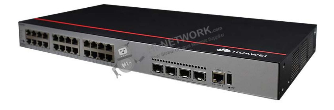
Figure 1 shows the appearance of S5735-L24P4X-A1.