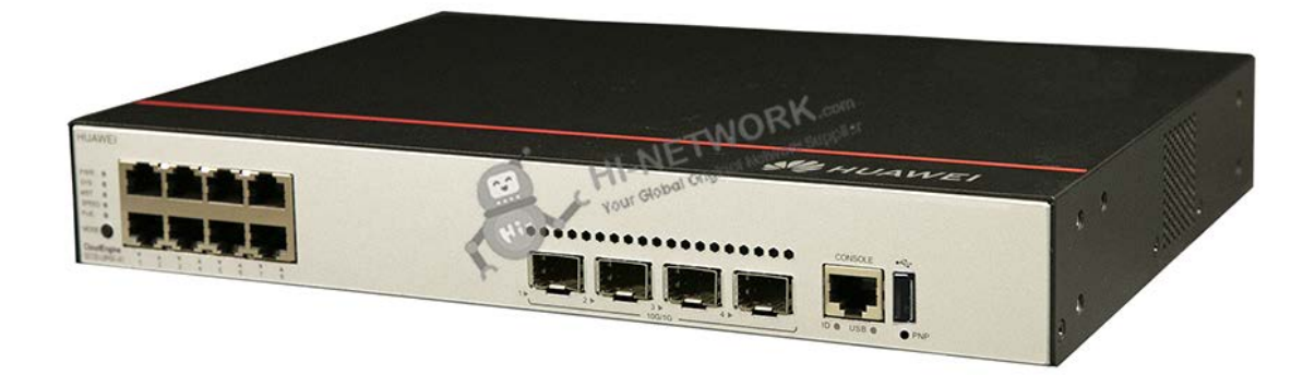
Figure 1 shows the appearance of S5735-L8P4X-IA1.