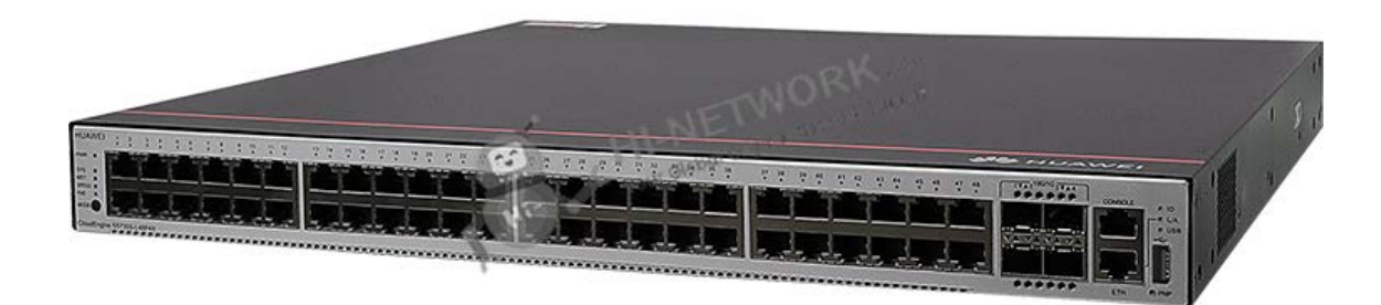
Figure 1 shows the appearance of S5735S-L48P4X-A.