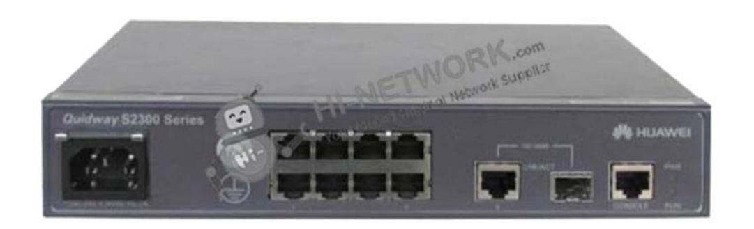
Figure 1 shows the appearance of LS-S2309TP-SI-AC.