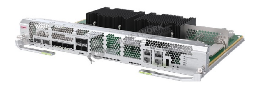
Figure 1 shows the appearance of LSG7SRUFX1T1.