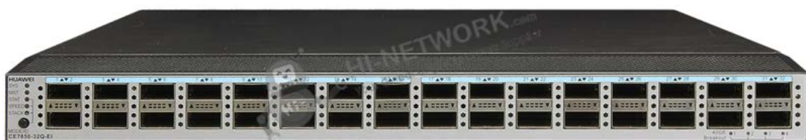
Figure 1 shows the appearance of CE7850-32Q-EI-F.