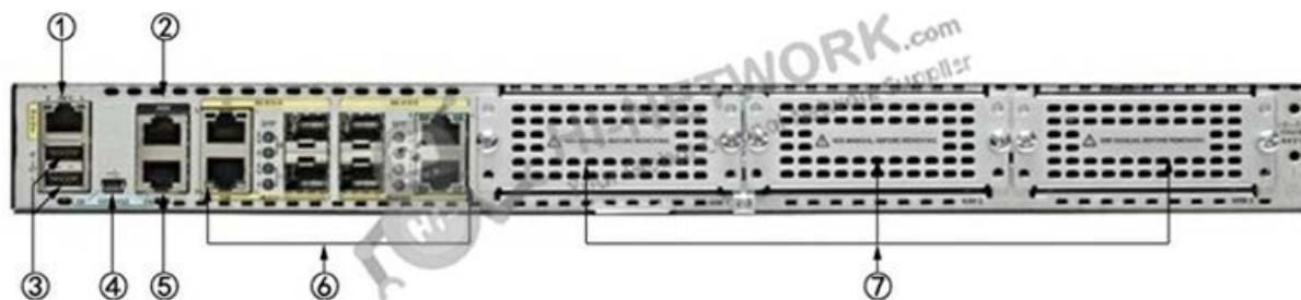
Figure 3 shows the back panel of Cisco ISR4431/K9.