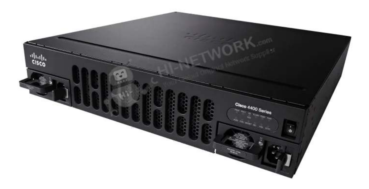
Figure 1 shows the appearance of Cisco ISR4451-X-VSEC/K9.