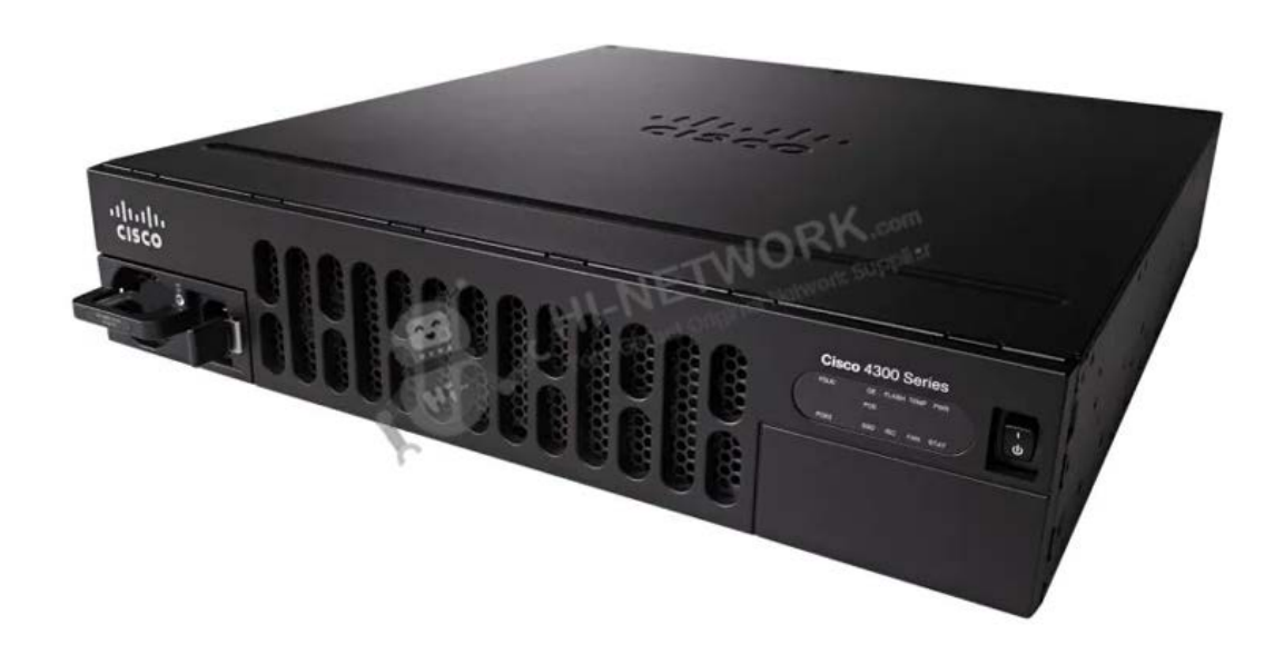
Table 1 shows the Quick Specs.

Figure 1 shows the appearance of Cisco ISR4351-SEC/K9.