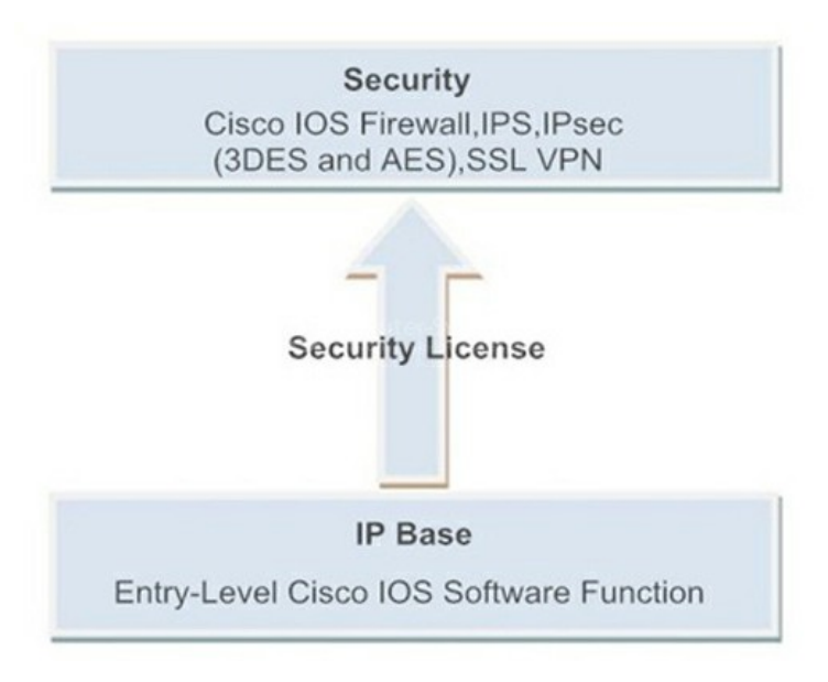
Figure 4 shows the Security Bundle features.