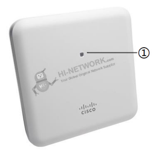
Figure 2 shows the AIR-AP1852I LED Indicator Position.