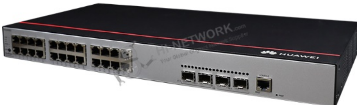
Figure 1 shows the appearance of S5735-L24P4S-A1.