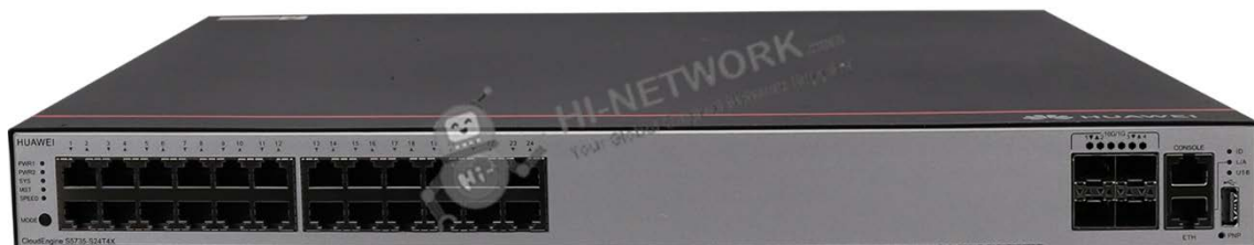
Figure 1 shows the appearance of S5735-S24T4X.