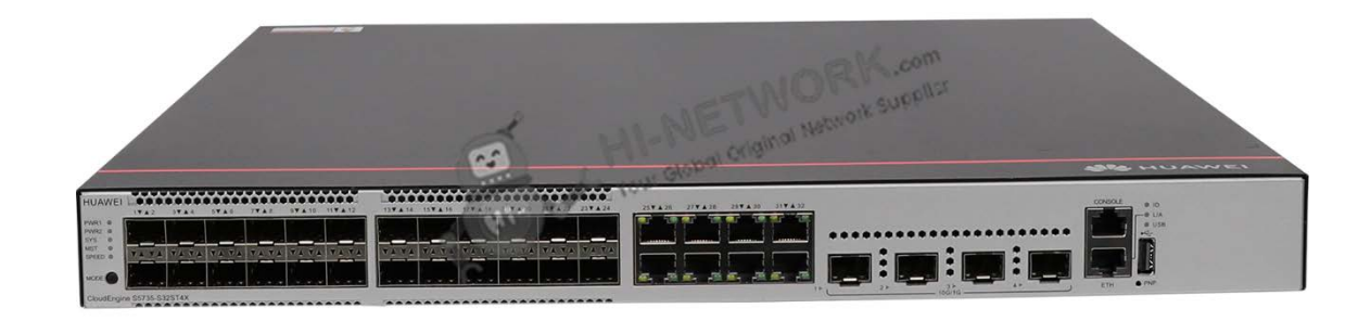
Figure 1 shows the appearance of S5735-S32ST4X.