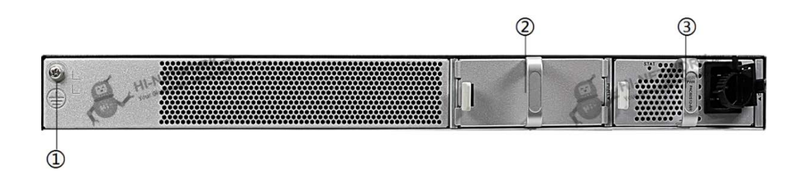
Figure 3 shows the back view of S5735-S32ST4X.