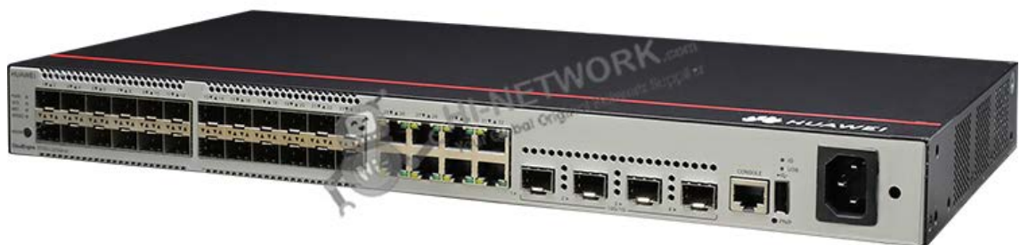
Figure 1 shows the appearance of S5735S-L32ST4X-A1.