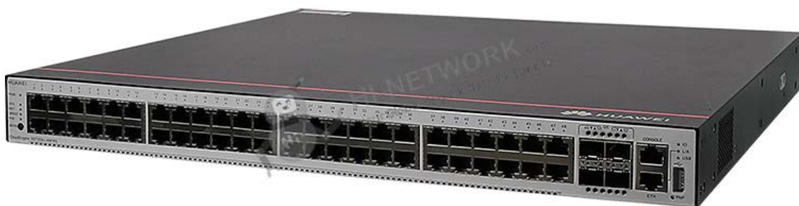
Figure 1 shows the appearance of S5735S-L48P4S-A.