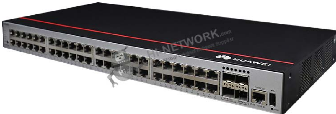
Figure 1 shows the appearance of S5735S-L48P4S-A1.