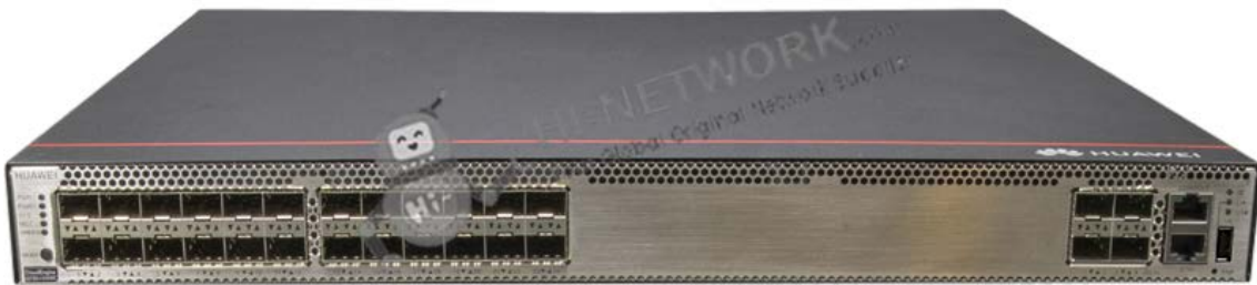
Figure 1 shows the appearance of S5735S-H24S4XC-A.