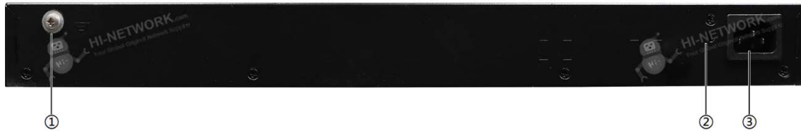
Figure 3 shows the back view of S5735S-L24P4S-A1.