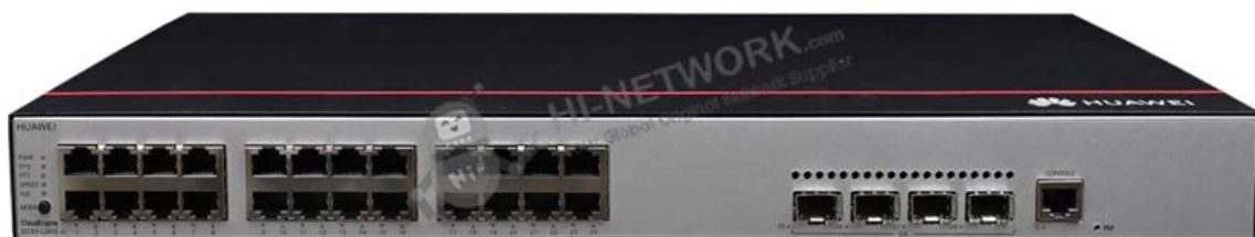
Figure 1 shows the appearance of S5735S-L24P4S-A1.