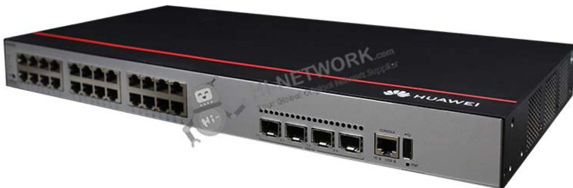
Figure 1 shows the appearance of S5735-L24P4X-A1.