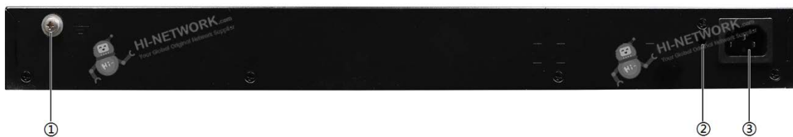
Figure 3 shows the back view of S5735-L48P4X-A1.