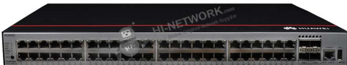
Figure 1 shows the appearance of S5735-L48P4X-A1.