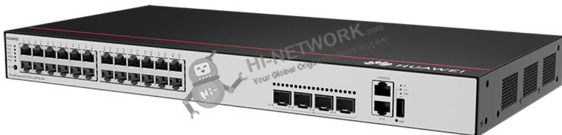
Figure 1 shows the appearance of S5735S-L24P4S-MA.