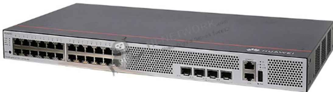
Figure 1 shows the appearance of S5735S-L24T4S-MA.