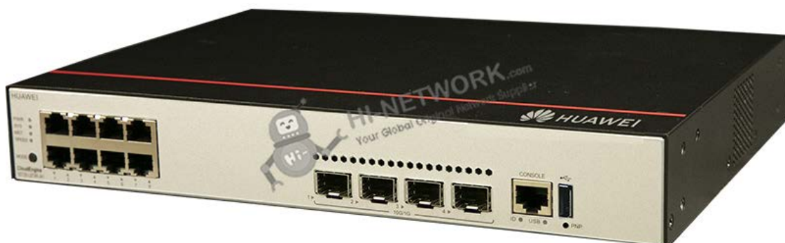
Figure 1 shows the appearance of S5735-L8T4X-IA1.