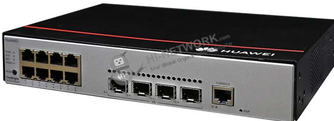
Figure 1 shows the appearance of S5735-L8T4S-A1.