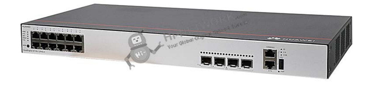
Figure 1 shows the appearance of S5735-L12P4S-A.