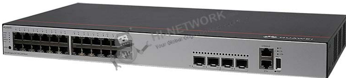
Figure 1 shows the appearance of S5735-L24P4S-A.