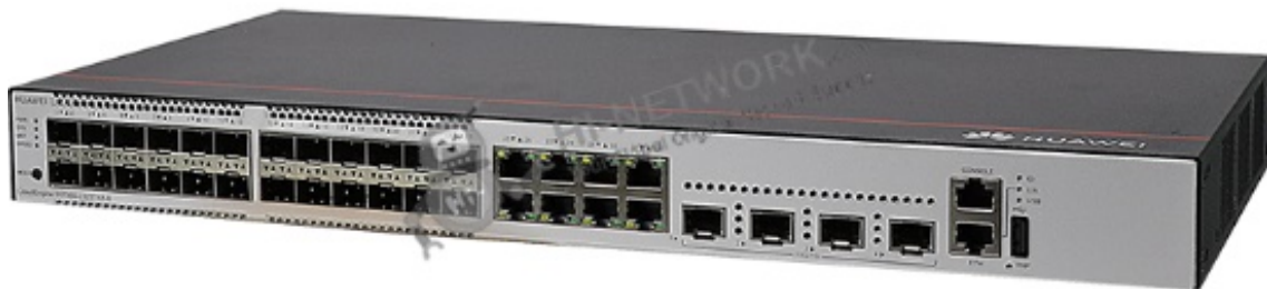
Figure 1 shows the appearance of S5735S-L32ST4X-A.