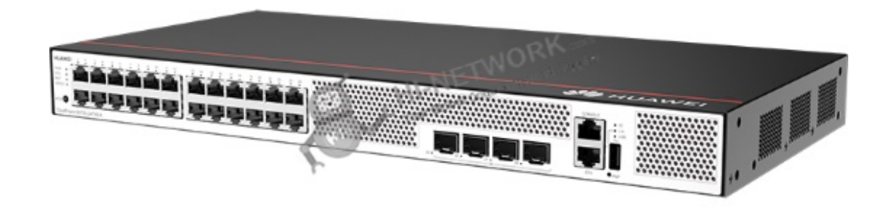
Figure 1 shows the appearance of S5735-L24T4S-A.