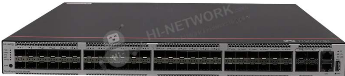
Figure 1 shows the appearance of S5735-S48S4X.