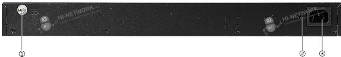
Figure 3 shows the back view of S5735-L48T4X-A.