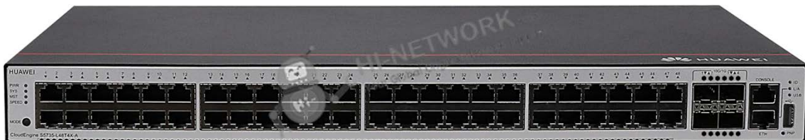
Figure 1 shows the appearance of S5735-L48T4X-A.