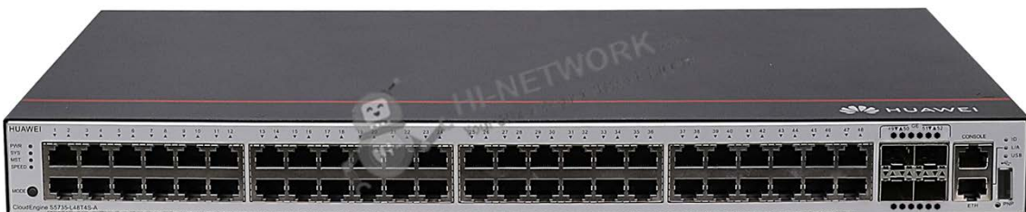
Figure 1 shows the appearance of S5735-L48T4S-A.