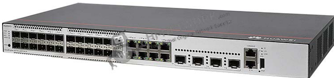
Figure 1 shows the appearance of S5735-L32ST4X-A.