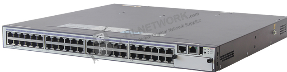
Figure 1 shows the appearance of S5710-52C-PWR-LI.