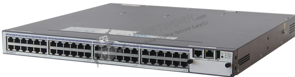
Figure 1 shows the appearance of S5710-52C-LI.