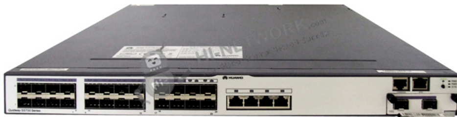
Figure 1 shows the appearance of S5700-28C-EI-24S.