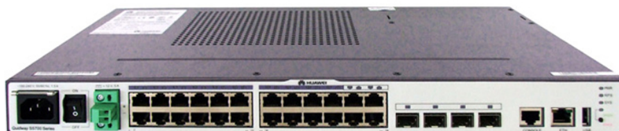
Figure 1 shows the appearance of S5700-24TP-SI-AC.