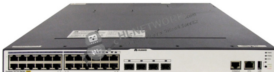
Figure 1 shows the appearance of S5700-24TP-PWR-SI.