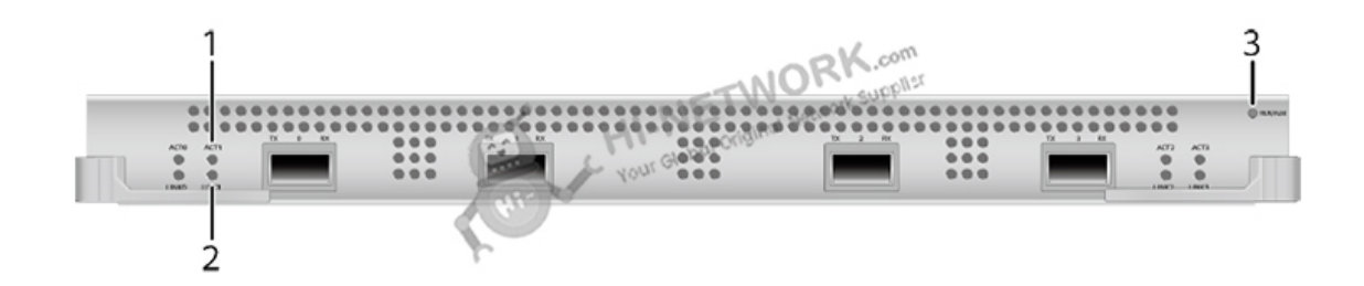
Figure 2 show the indicators on the ES1D2C04HX2E panel.