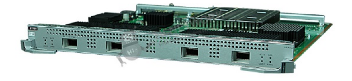
Figure 1 shows the appearance of ES1D2C04HX2E.