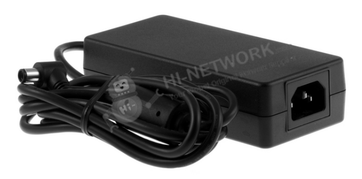
Figure 1 shows the appearance of CP-PWR-CUBE-4.