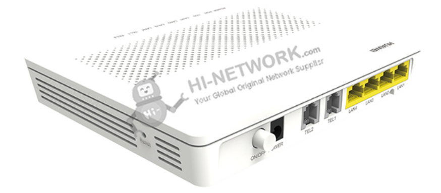
Figure 1 shows the appearance of EchoLife EG8240H.

Buy Huawei, Cisco, Zte, Hpe, Dell, Fortinet Network Equipment Online In China At Low Price! www.hi-network.com