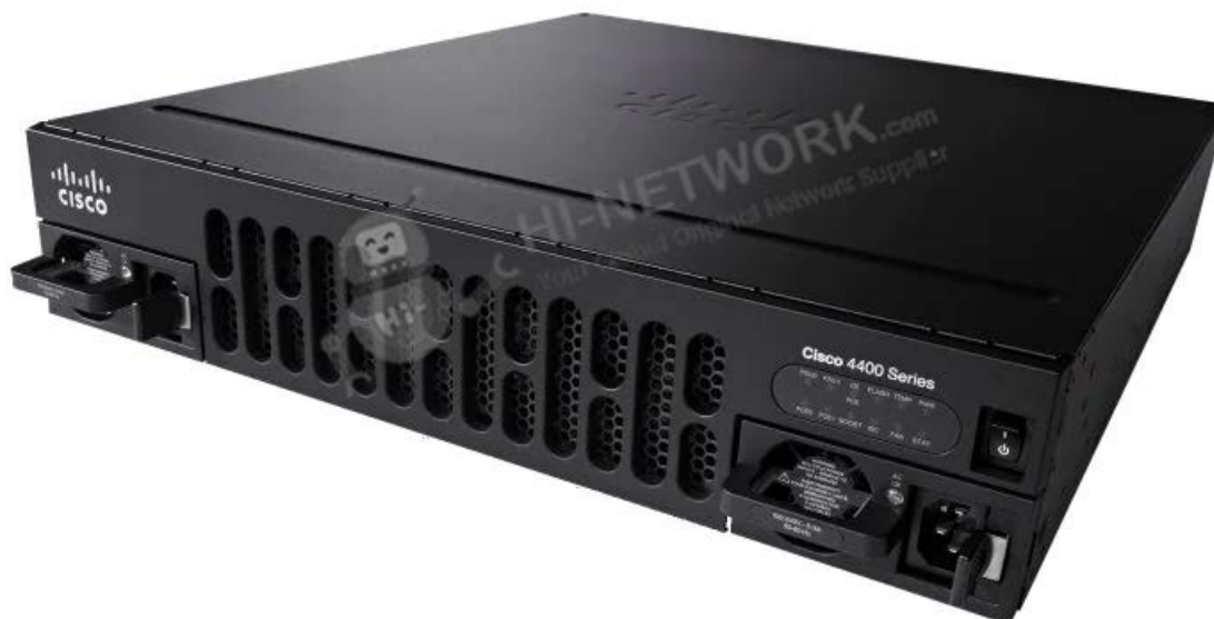
Table 1 shows the quick specification.

Figure 1 shows the appearance of ISR4451-X-AXV/K9.