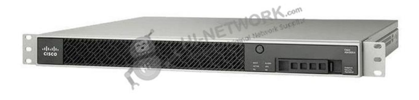
Figure 1 shows the front view of ASA5512-FPWR-K9.