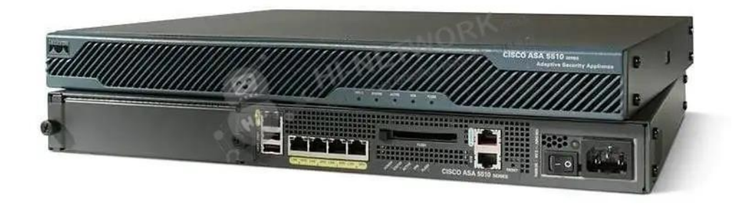
Figure 1 shows the appearance of ASA5510-K8.