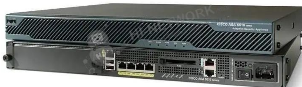
Figure 1 shows the appearance of ASA5510-BUN-K9.