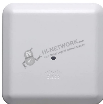
Figure 1 shows the appearance of the AIR-AP2802I-E-K9.