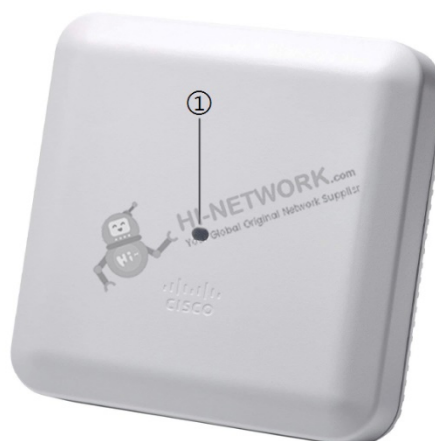
Figure 2 shows the face of AIR-AP2802I Model.