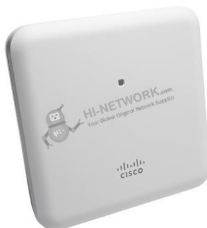
Figure 1 shows the appearance of the AIR-AP1852I-C-K9.