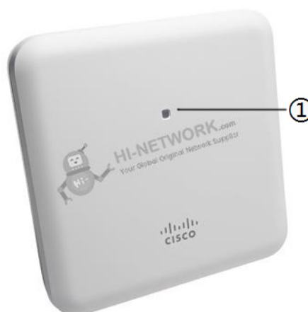
Figure 2 shows the AIR-AP1852I LED Indicator Position.