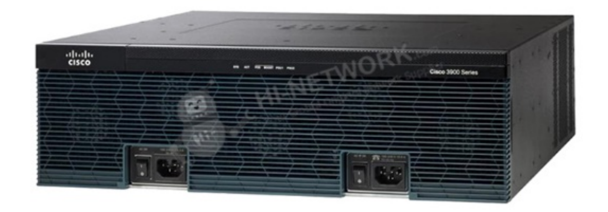
Figure 1 shows the appearance of C3945-VSEC/K9.