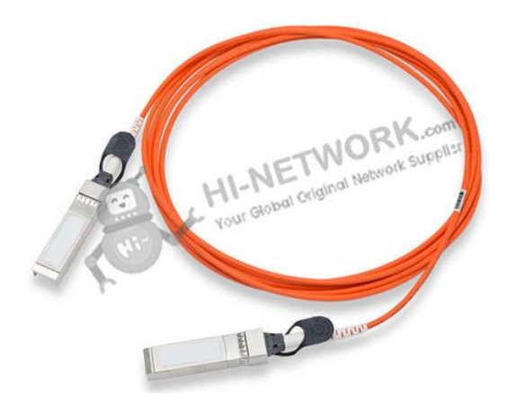
Figure 1 shows the appearance of SFP-10G-AOC10M.